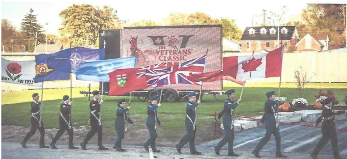
Veterans Classic cadet colour parade, October 19, 2018