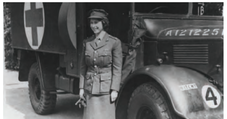
Princess Elizabeth became one of the 250,000 women who were members of the Auxiliary Territorial Service in WWII.

SAVE STAMPS. SAVE PAPER: Sign up to receive the Link online at http://eepurl.com/dLIqJo