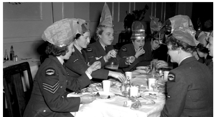
RCAF Womens Division, Christmas Dinner December 23, 1942